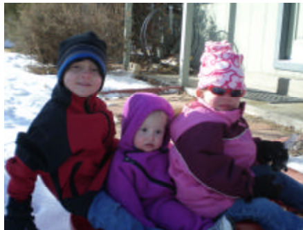
The King kids out sledding on a "warm" day